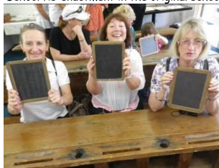
School Re-enactment in the original school

To see photos of the events please visit www.mooloolah150years.org